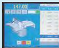
10.4 inch Color Screen

9999 setting program, 500000 cuts storage