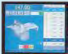
8 inch Color Screen

100 setting program, over 6000 cuts storage