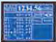
5.7 inch Blue Screen

50 setting program, 99 cuts storage for every program